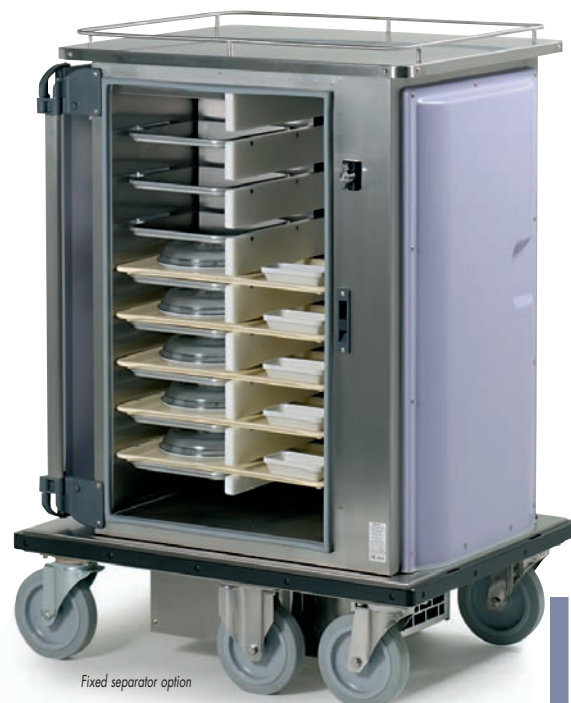
Fixed separator option