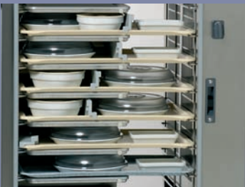
The modular tray