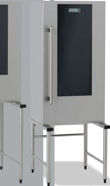
Optional Energis Stand

The Thermocontact regenerating system invented and always improved by ISECO is the only system allowing soft regeneration for a perfect result.