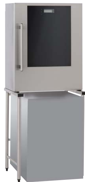
Energis on high stand for integration of a fridge

ISECO International 2, avenue de Kaarst • Euralliance Porte A • BP 52004 • 59777 EURAILLE FRANCE Tél. : + 33 3 59 35 20 85 • Fax : +33 3 59 35 20 86