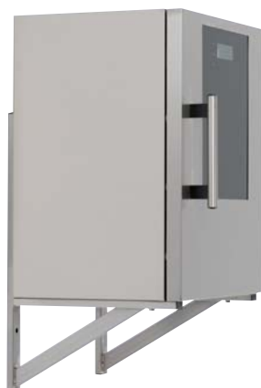
Energis on wall bracket