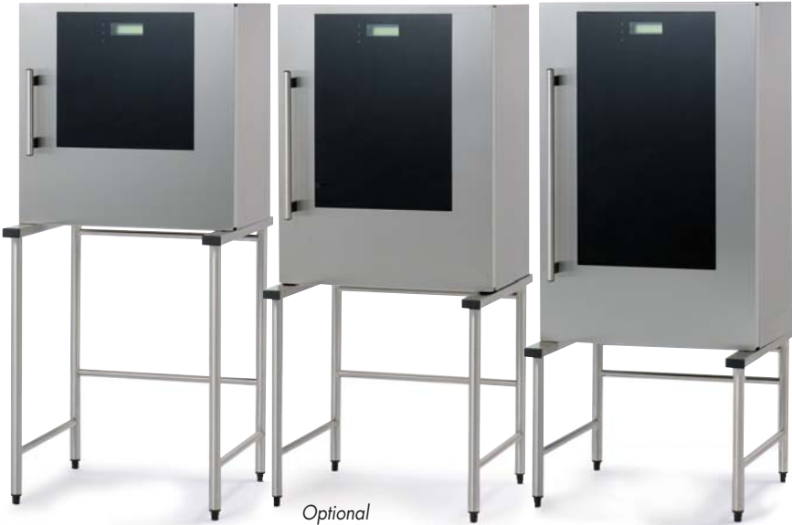
Optional Energis Stand

Energis and Energis Compact are available with 4, 6, 8 or 12 shelves.