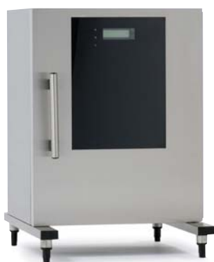
Energis on stand